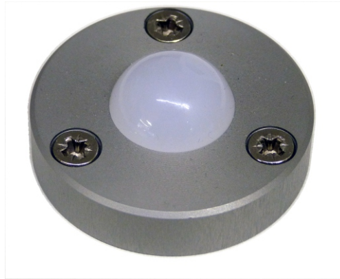
ABL45WSF, 24 VDC